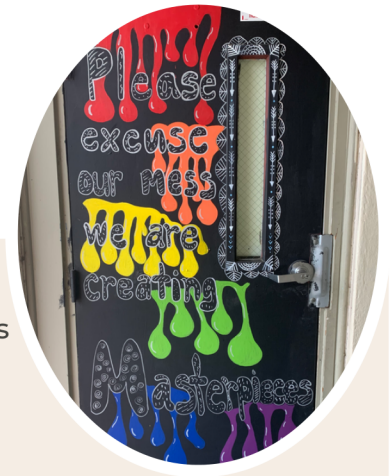
The door to creativity, also known as Miss Julie's art room

Building on the momentum of last year's success, we are increasing the frequency of music instruction, devoting an entire trimester to performing arts, and adding ceramic arts.