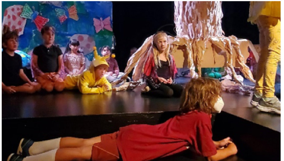
Ms. Keedy's 2nd grade class preparing for their play.

The total budget for 2022-23 is $110,000. We aim to cover $100,000 through donations to the Annual Fund. We can reach this goal if at least 80% of SCS families contribute $50 per student per month.